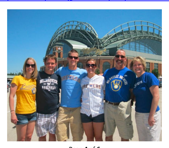
Page 4 of 6

https://www.ptk.org/portals/0/docs/scholarships/resources/kaplan_scholarship_resume_advice.pdf http://www.rollins.edu/career-life-planning/documents/samples-resumes-from-high-school.pdf